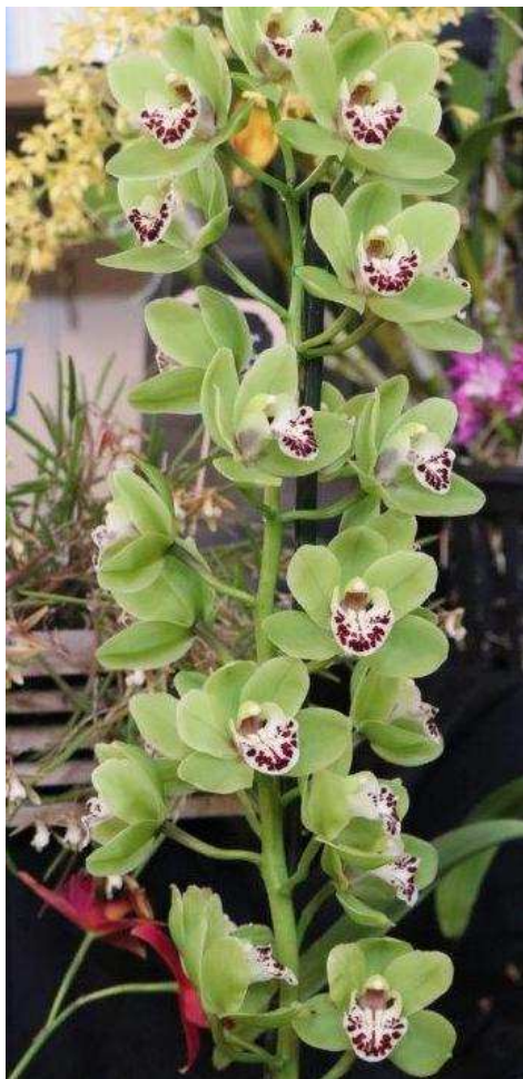
Cym. Gentle Touch 'Bon Bon'

Owner: Gwen Allen