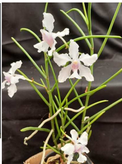
Aerides vandarum