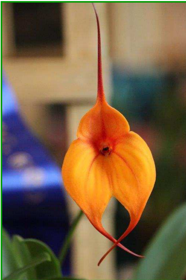
Masdevallia Curacao 'Goldie' Grand Champion 2023 Spring Show Owner: Ian Woodgate