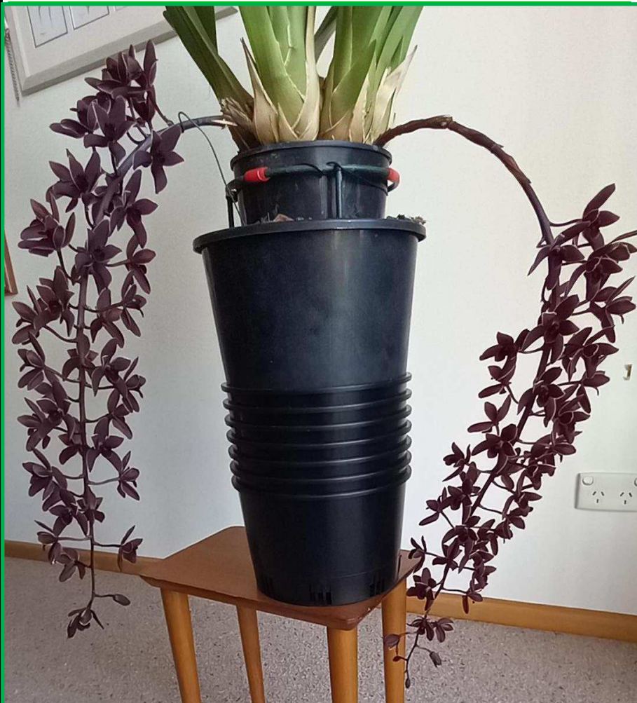
Cym. Black Stump 'Come in Spinner'