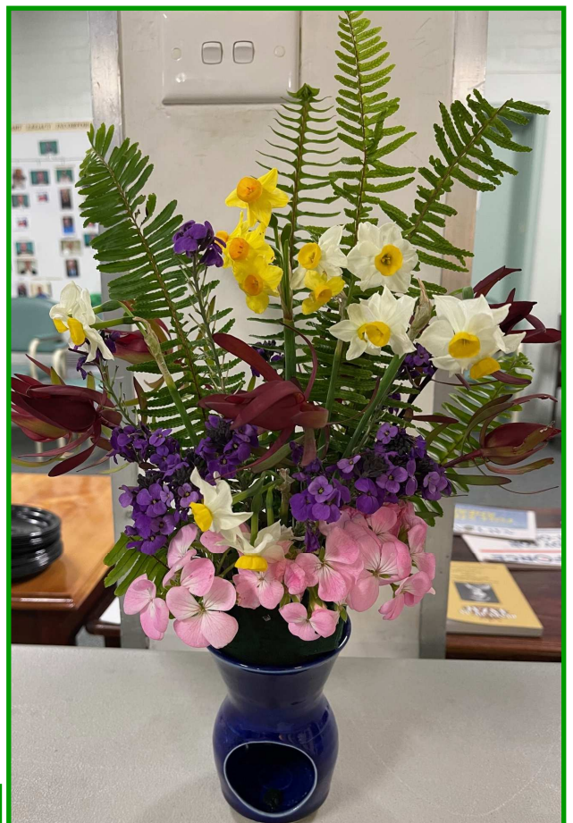
Floral Arrangement "From the Garden"