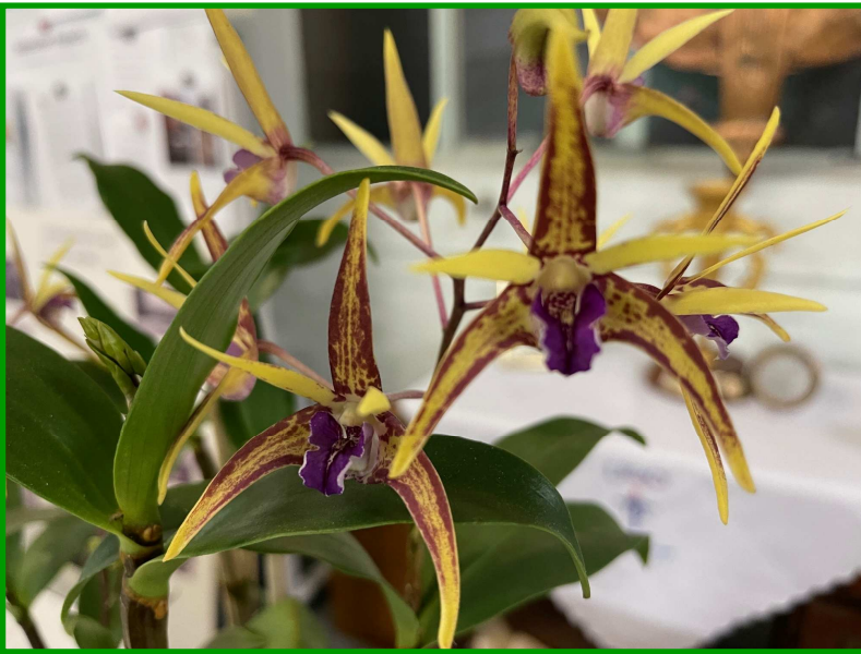
Dendrobium Rutherford Starburst 'Tinonee'