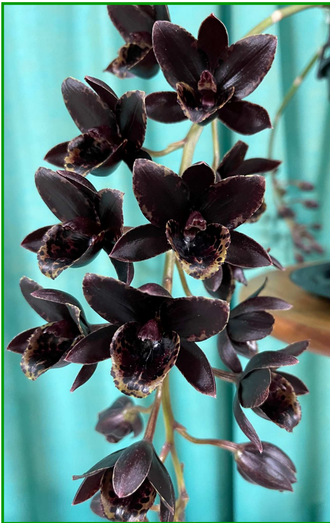
Fredclarkara After Dark 'Bakers Cherry Madness'