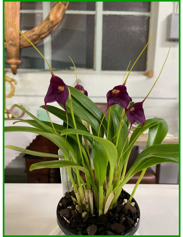
Masdevallia chaparensis x cucculata