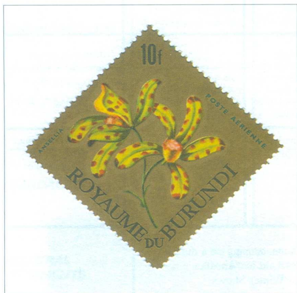
Ansellia pseudobulbs are a stock-in-trade for the Zulu herbatlist said to cure madness.

Salep has been derived from a wide range of terrestrial orchids throughout Europe.