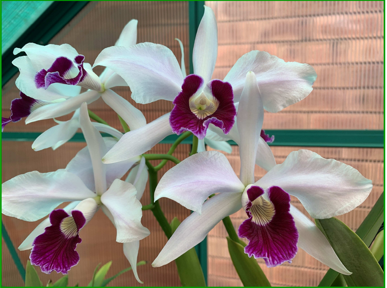
Cattleya purpurata var. werckhauseri X Cattleya elegans var. coerulea